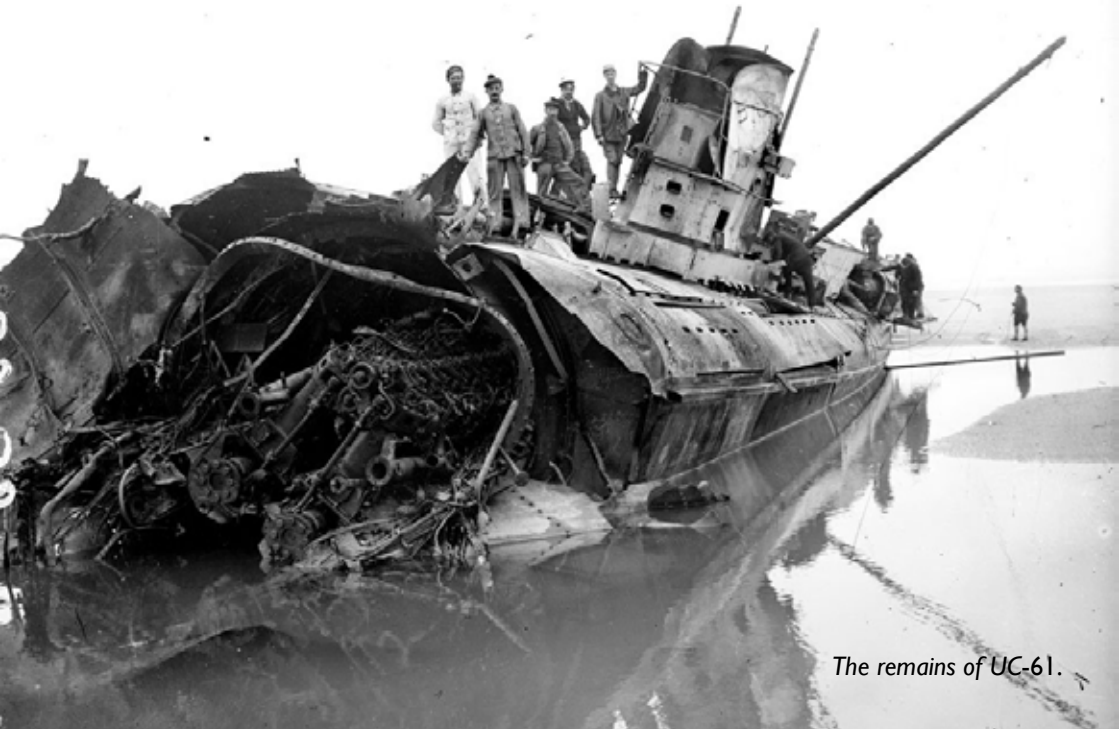
The remains of UC-61.

Much too early he started suffering from his serious illness and only rarely when you visited him, the remembrance of times spent together lit up in him. 54