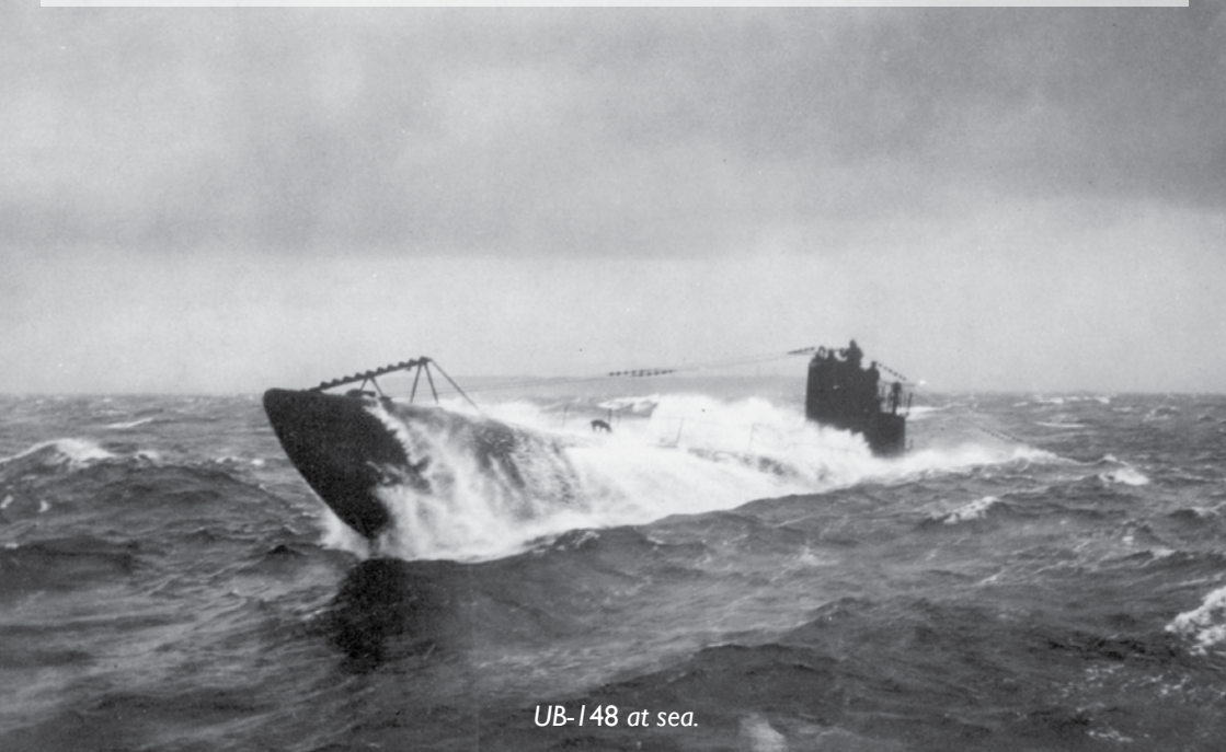
UB-148 at sea.