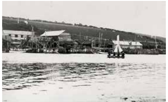
Dates Boatyard, 1983. The visible ribs of a vessel belong to the Little Gem.