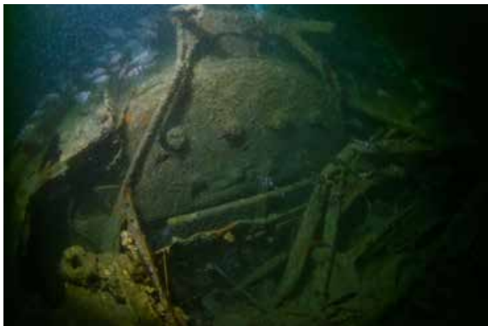
The boiler of the wreck of the Arfon . You can tour the wreck of the Arfon virtually online at: www.cloudtour.tv/arfon

Early on the Saturday, even before Little Mystery had sunk, the Admiralty moved to clear these new mines laid by UC-61; that speed brought Gerth’s second success of the day, although unknown to him until later. HMT Arfon , a coal-burning, ketch-rigged Milford trawler, was requisitioned for war service