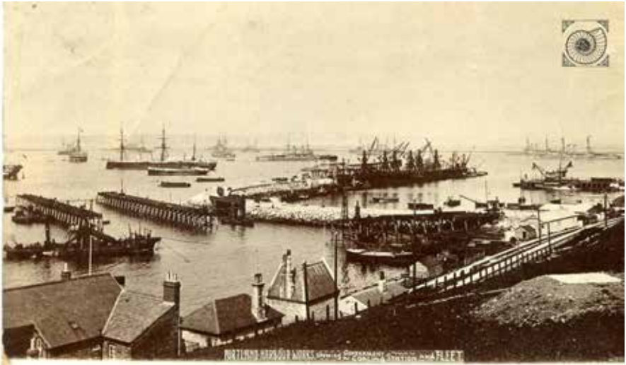
Portland Harbour in 1905.

The French Government are faced by an extremely grave crisis caused by the coal shortage in France. This shortage has already necessitated the closing down of a number of factories engaged in work of national defence. M. Briand fears that if the present state of affairs is prolonged there will be an interruption in the production of the most important requirements. 25 The French Government consider that it is essential to address to the British Government an urgent appeal begging them to make a serious effort capable of remedying this state of affairs.